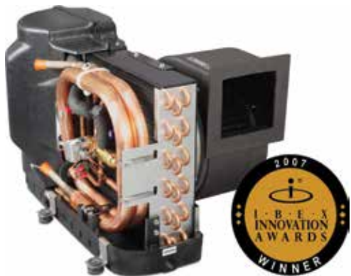
Turbo air conditioner shown with optional sound cover

The Stowaway Turbo series completely revolutionized self-contained boat air conditioning (cooling and heating) with patented innovations in marine air conditioning system design, winning the IBEX Innovation Award in 2007.