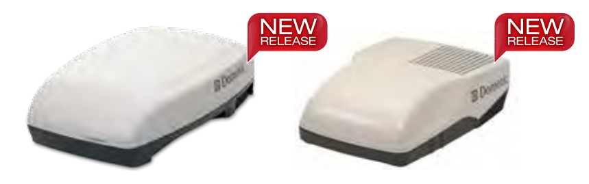
Dometic FreshJet 3200

This stylish distribution box has four way vents and ambient lighting. The vents are ideal for directing the air where required within your caravan or RV. *FJ3200 model only