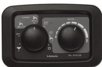
The Dual Top Standard Manual Control Unit